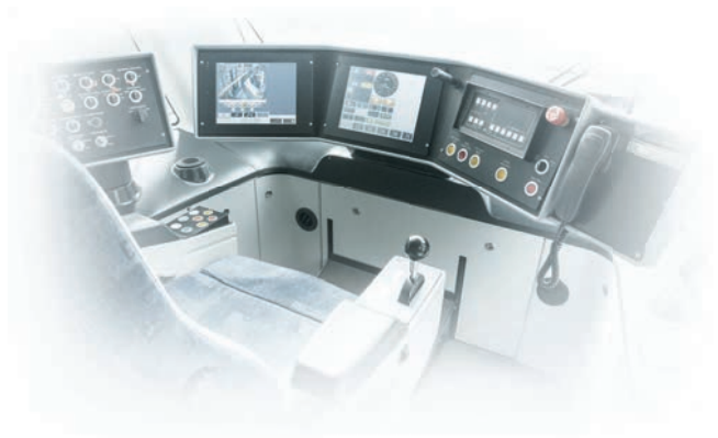
// ADAPTIVE & SMART VIDEO SURVEILLANCE

Scalability is inherent in standards-based platforms compared to a system that uses proprietary technologies where there may be an extended time between solution iterations and innovations. Because many companies are responsible for defining the open system standard, developers can be assured of continued advancements in features and capabilities as a central part of the specification along with a reliable degree of backward compatibility. Another important fact why an open standard approach is superior is that there is broad knowledge of the specification, computing architecture and particular form factor from multiple technology suppliers. Plus, using a modular COTS approach enables operators to configure based on their needs -- from lower end single-core systems to integrating multi-core processors for higher performance requirements.